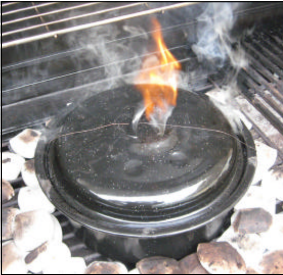
Charcoal burner on Bar_B_Q. Note the gas flare